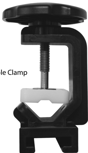
B&B Single Pole Clamp