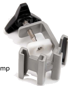
Venti.Plus Dual Pole Clamp

The B&B Single Pole Clamp and Venti.Plus Dual Pole Clamp are ISO for compliant mounting on poles 2.0 to 3.2 cm in diameter.