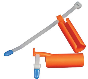
Universal Bite Block (Adult)

The Universal Bite Block is the most complete system to prevent biting of the endotracheal tube and occluding or rupturing the cuff inflating tube. The latex free Universal Bite Block secures directly on the endotracheal tube and allows for delivery of proper oral hygiene by providing unobstructed bilateral access to the oral cavity. The Universal Bite Block can also be used for protection of closed suction catheters, endoscopes, bronchoscopes and oral gastric tubes.