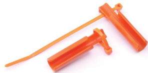
Universal Bite Block (Pediatric)

The adult-sized Universal Bite Block fits 6 mm and larger endotracheal tubes and is secured with a Releasable Cable Tie. The pediatric-sized Universal Bite Block fits 4 to 6 mm endotracheal tubes and is secured with a cable tie. When